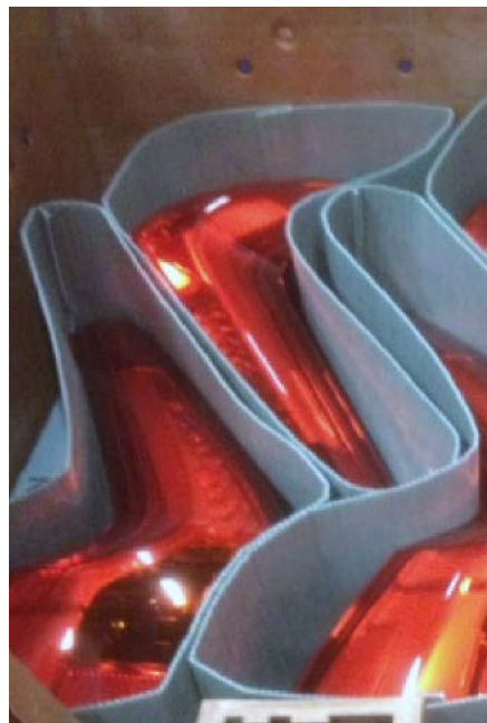
Superb nesting capability