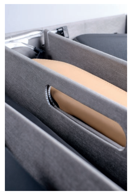
Superb surface protection