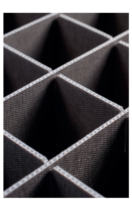
High stacking strength