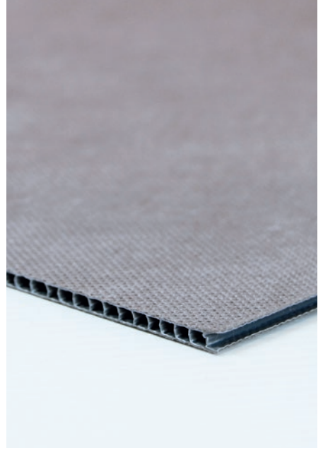
Heat laminated surface - No glue