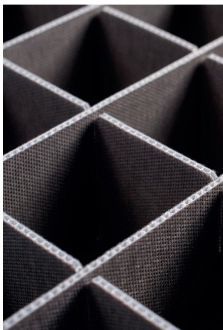
High stacking strength