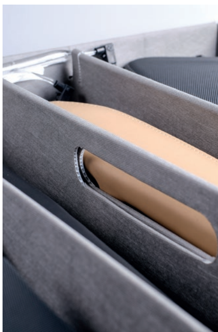
Superb surface protection