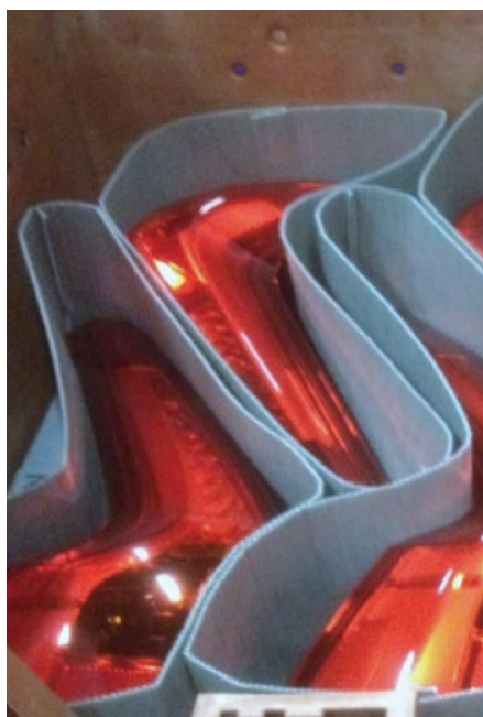
Superb nesting capability