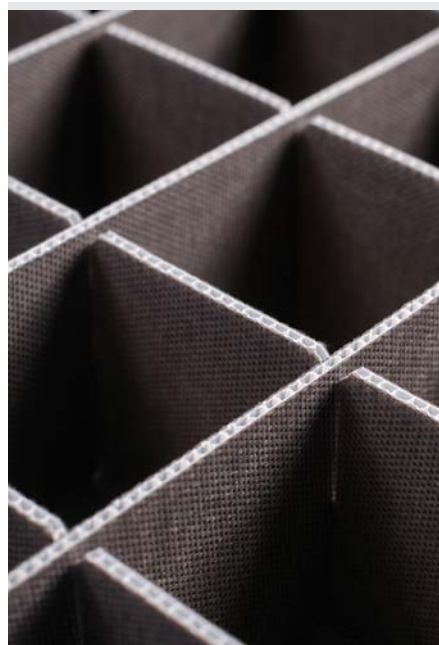
High stacking strength