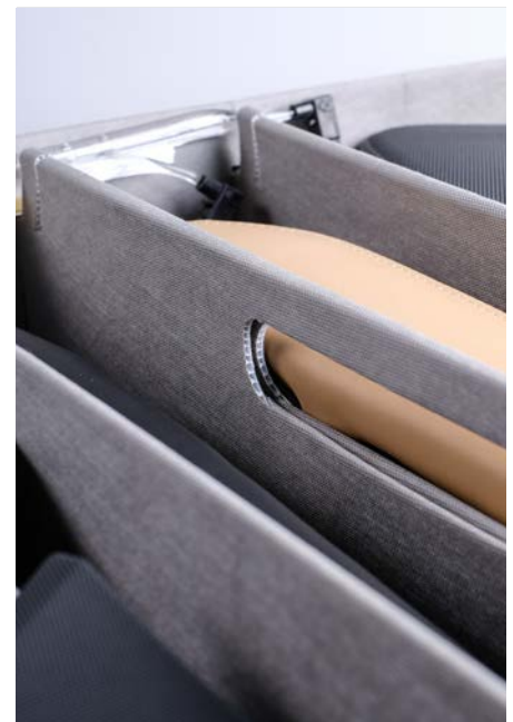
Superb surface protection

Contact us for more information, samples or prices.