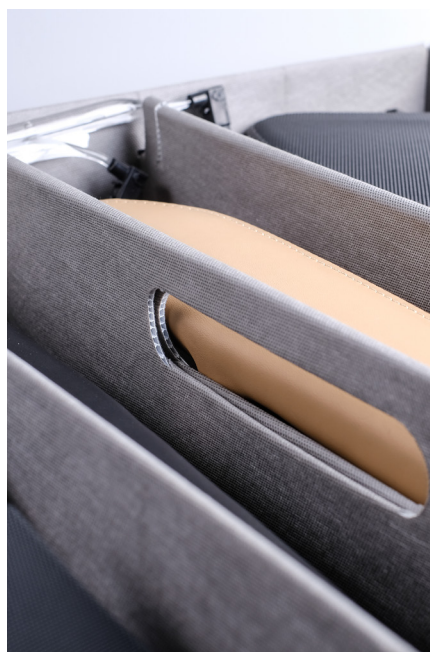
Superb surface protection