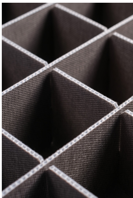
High stacking strength